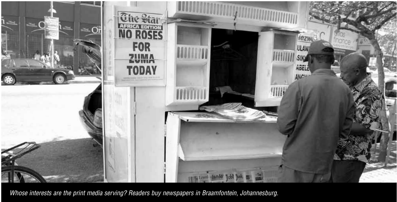
Whose interests are the print media serving? Readers buy newspapers in Braamfontein, Johannesburg.