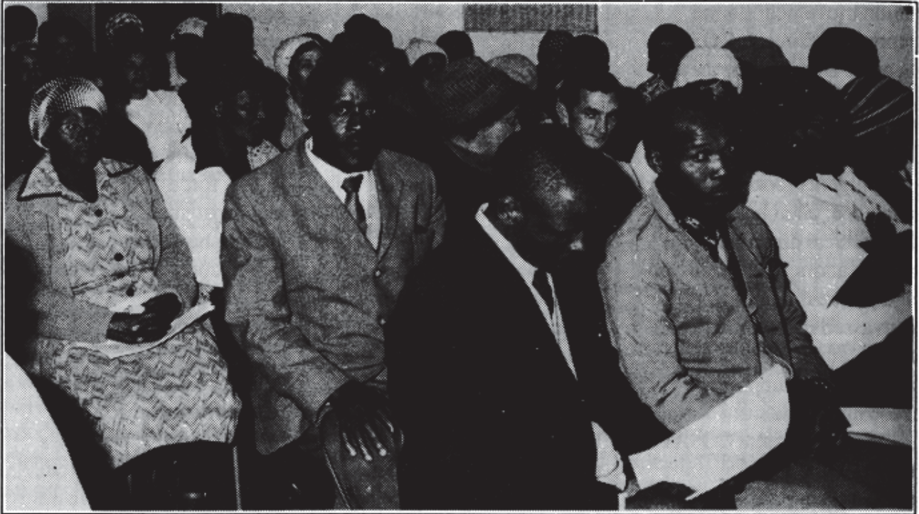
Worker meeting: built as a resistance movement, COSATU faces complex new challenges