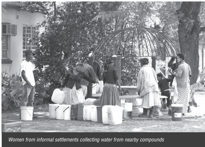
Women from informal settlements collecting water from nearby compounds

Our survey of NUM members in 2005 found that mineworkers who live in compounds are more likely to attend union mass meetings compared to those who live in other forms of accommodation. The implications of this for union organising are clear. New residential patterns are leading to a decline in participation in union activities. The NUM is responding by arranging meetings at times when workers come back from underground shifts