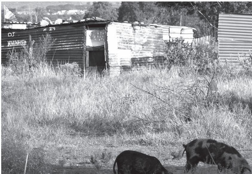
Many miners save their living out allowances and live next to mines in shacks

Sections of some compounds have been converted to accommodate women miners, who are joining the industry in increasing numbers. Conversions mean that workers have more privacy than in the old days when up to 20 men used to share a dormitory with bunk beds. But, despite the longstanding demand of the union for the conversion of compounds into family units, many mineworkers still prefer not to bring their families to the mines.