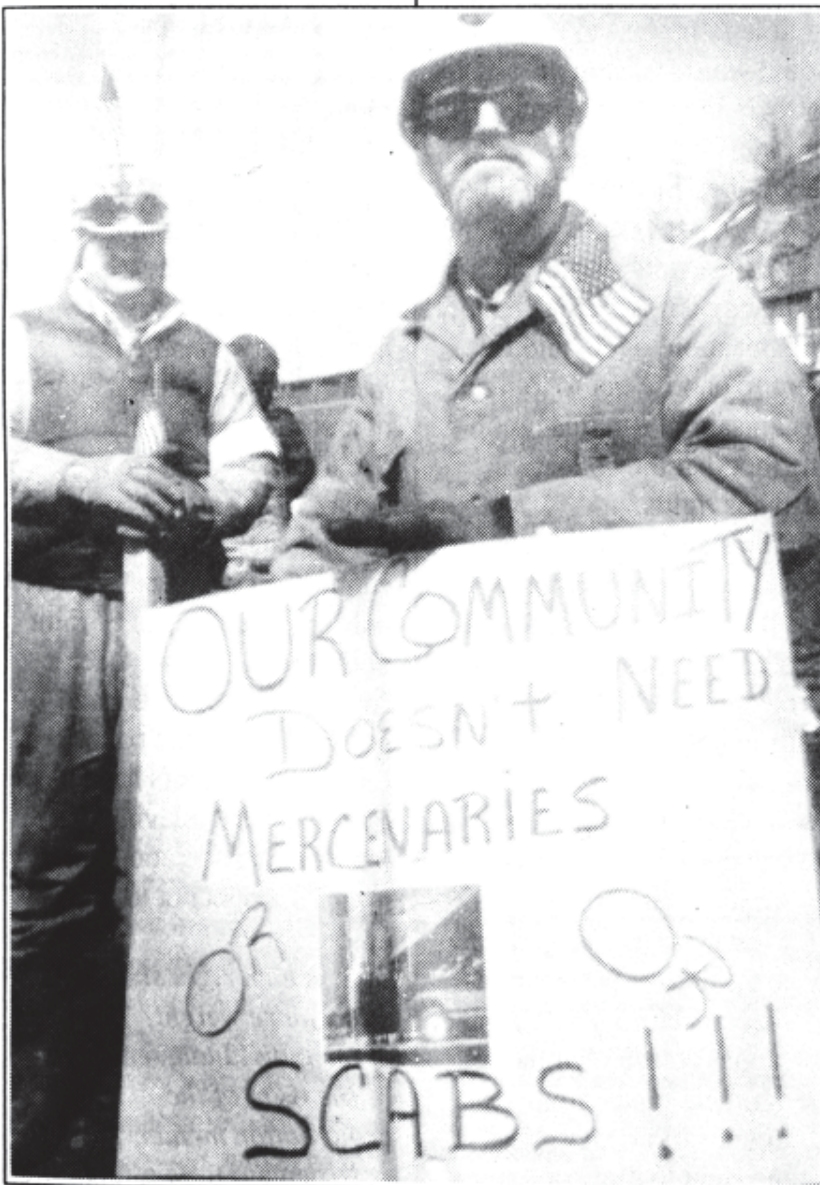
American workers on picket - the closed shop can reduce the incidence of scabbing and violence