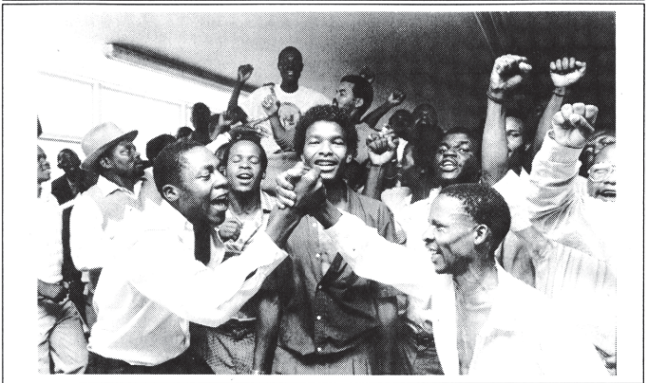
Closed shop - strengthening workers' unity and democracy