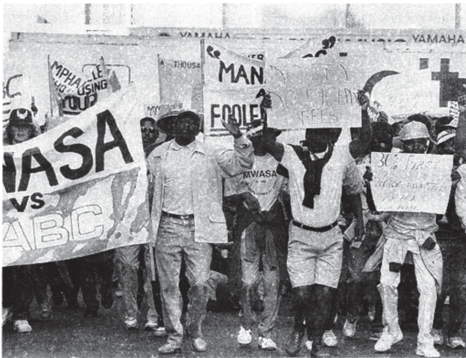
MWASA strikers on the march against the SABC