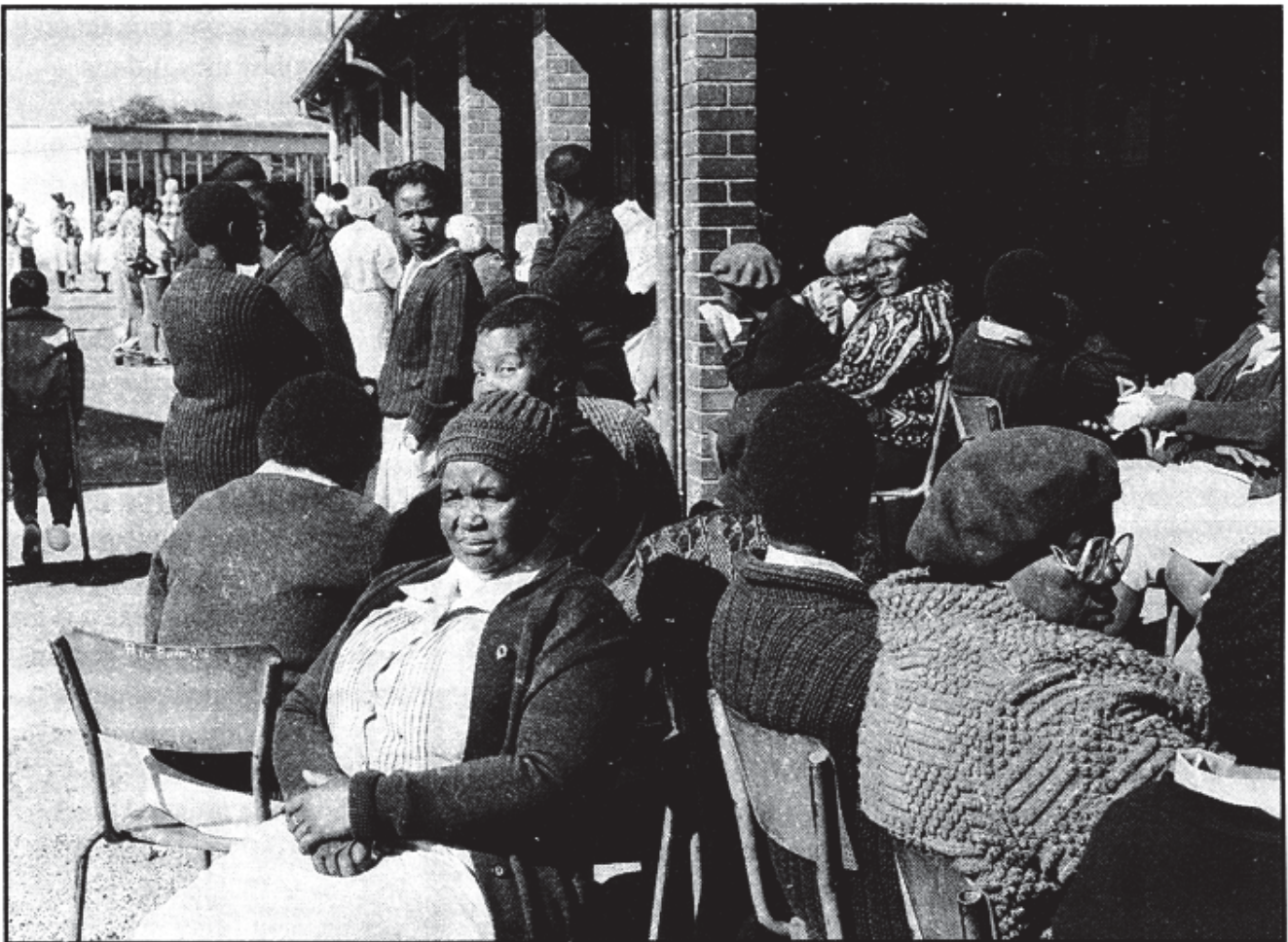
Workers sit out the strike at Baragwanath in defiance of a court interdict