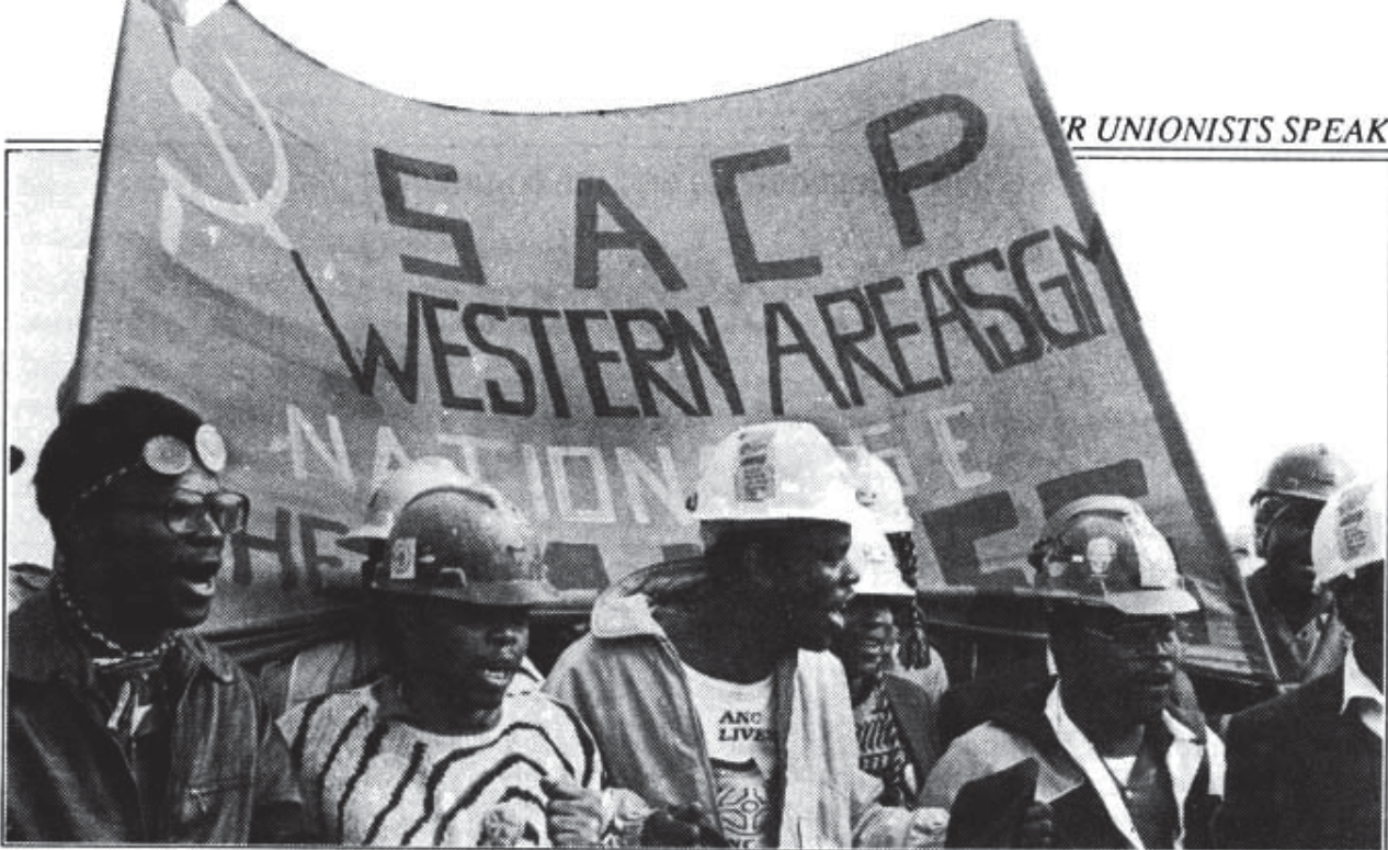
Under the party flag - will workers push for the party and ANC to merge as one socialist force?