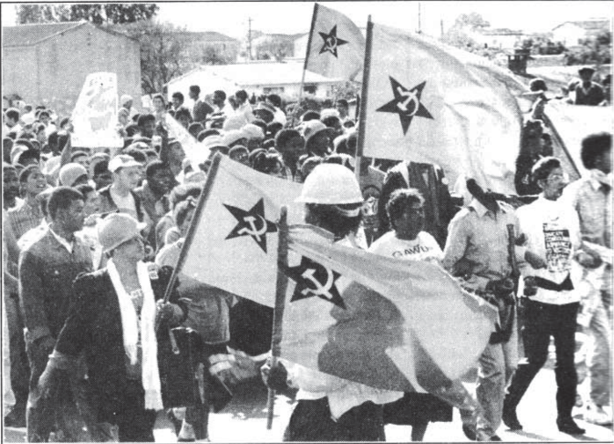
Unions are poised to play a crucial role in democratising the party